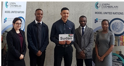
Model United Nations (March 2017)