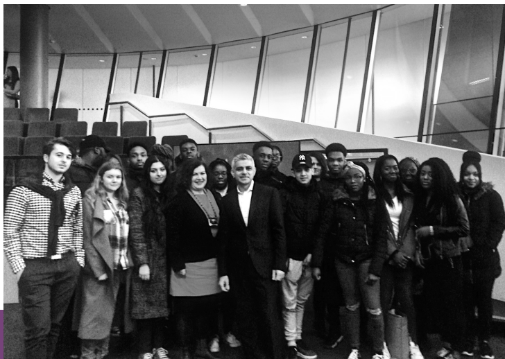
Politics students with Mayor of London Sadiq Khan (January 2017)