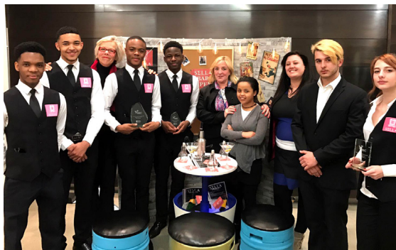
Young Enterprise - Central London Finals (April 2017)